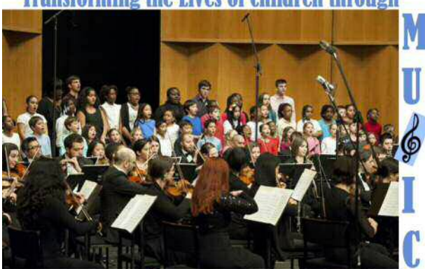
Over 350 at-risk children sent to Wagon Road Camp since 2007

Transforming the Lives of Children through