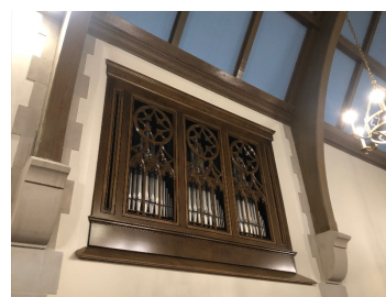
Rye Presbyterian Rye, NY